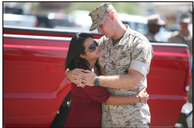
Currently 30,000 Marines are deployed around the world.

The challenging nature of the terrain in Afghanistan requires a greater level of dismounted operations than was the case in Iraq. This fact coupled with the prevalence of improvised explosive devices has caused a growing class of Marines and Soldiers to suffer catastrophic injuries—injuries involving multiple amputations that present significant quality of life challenges. Our Corps, the DoN, DoD, the Department of Veterans Affairs (VA) and Congress are concerned about this special group of Wounded Warriors must remain committed to supporting this special group of Wounded Warriors. To help the catastrophically injured (those who will likely transition to veteran status) and their families successfully meet these challenges, we must continue engaging in a high level of care coordination between our WWR advocates, the VA's Federal Recovery Coordinators, VA Liaisons for Healthcare stationed at DoD Military Treatment Facilities (MTFs), Operation Enduring Freedom/Operation Iraqi Freedom/Operation New Dawn Case Managers and medical providers to ensure all of our wounded Marines' needs are met. This includes arranging for assistive technologies, adaptive housing, and all available health care and benefits (DoD and VA) they have earned. Additionally, WWR's Marine Corp Liaison assigned at the VA collaborates closely with VA Care Management team to resolve Marine Corp issues or care management needs.