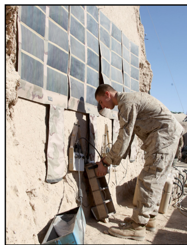
Marines utilizing a Solar Portable Alternative Communication Energy System.

Over the FYDP, I have directed $350 million to “Expeditionary Energy” initiatives. Fifty-eight percent of this investment is directed towards procuring renewable and energy efficient equipment. Some of this gear has already demonstrated effectiveness on the battlefield in Helmand Province. Twenty-one