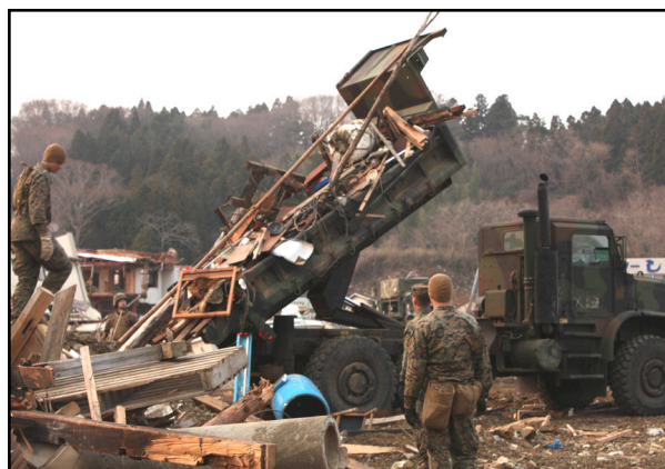
31st MEU at Uranohama Port, Oshima Island, Japan, in support of Operation TOMODACHI.

Day-to-Day Crisis Response: Engagement and crisis response are the most frequent reasons to employ our amphibious forces. The same capabilities and flexibility that allow an amphibious task force to deliver and support a landing force on a hostile shore enable it to support forward engagement and crisis response. The Geographic Combatant Commanders have increased their demand for forward-postured amphibious forces capable of conducting security cooperation, regional deterrence and crisis response.