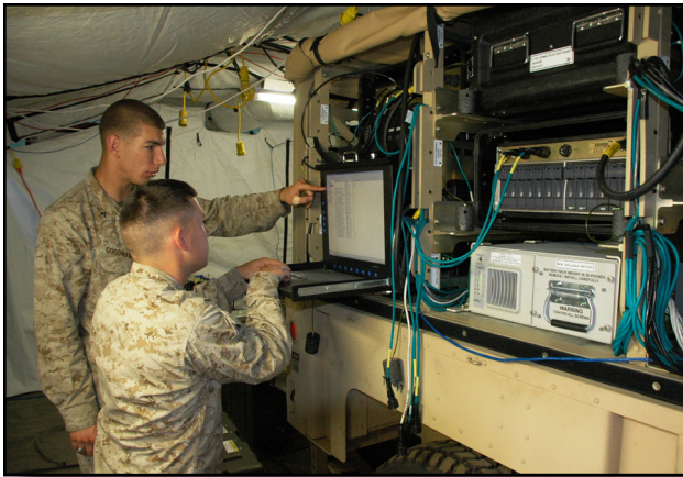
Marines monitor data in support of a combat operation center.