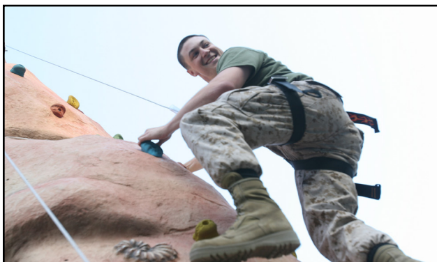
Single Marine Program provides fun and involved events for single and unaccompanied Marines.

recognized unique installation or command missions, locations or market conditions; (2) balancing available resources to support priorities and defined capabilities; and (3) developing accountability and inspection processes to support capability sustainment. Efforts are currently under way to apply these results and develop actionable program plans and supporting resource requirements to provide and maintain capabilities at the appropriate level for the right duration.