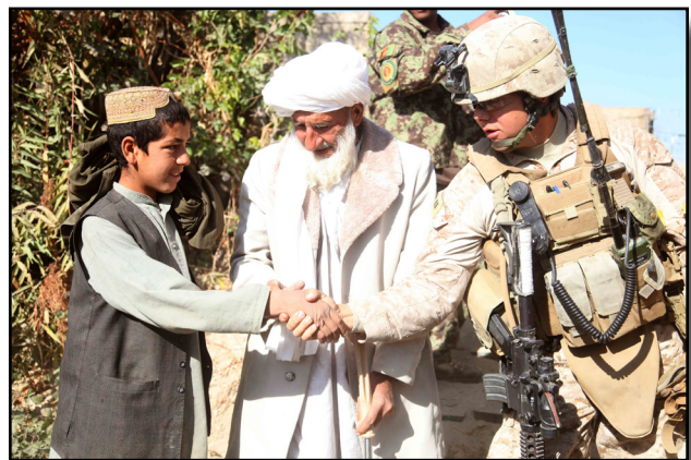
Sangin District, Afghanistan