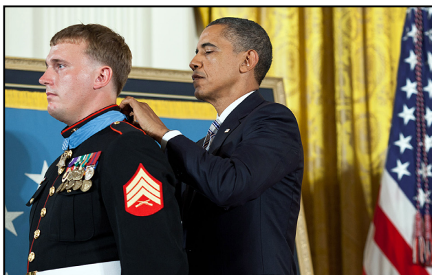
President Barack Obama awards the Medal of Honor to Sergeant Dakota Meyer.

We will work to ensure the critical needs of our families are met during times of deployment and in garrison by providing the services, facilities and programs to develop the strength and skills needed to thrive while facing the challenges of operational tempo. If wounded, injured or ill (WII), we will seek out every available resource to restore Marines to health. We will enable the return to active duty for those seeking it. For those unable to do so, we will responsibly transition them to civilian life. We will support and protect the spouses and families of our wounded and those of our fallen Marines. There are several areas and programs central to our tenet of “keeping faith with Marines, Sailors and their families.”