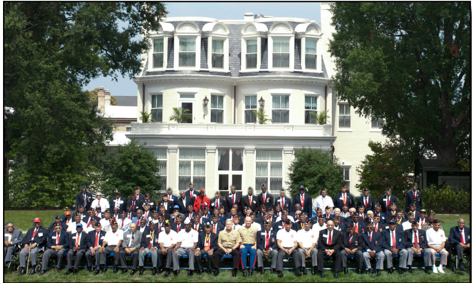
Commandant and Sergeant Major of the Marine Corps with Montford Point Marines.

highlight the importance of our SAPR program. Our victim-centric SAPR program focuses on: preventing sexual assault, improving a victim's access to services, increasing the frequency and quality of information provided to the victim regarding all aspects of his or her case and expediting the proper handling and resolution of a sexual assault case. We are credentialing our Sexual Assault Response Coordinators and Victim Advocates on victim advocacy. We have standardized training protocols for our 24/7 hotline, in use at all major bases and stations to provide information, resources and advocacy of sexual assault. We have increased SAPR training at all levels for our judge advocates (JA). This year, mobile training teams from our Trial Counsel Assistance Program will continue to instruct Navy Criminal Investigative Service agents and JAs on sexual assault investigation and best practices at bases and stations in Japan, Hawaii and on the East and West coasts.