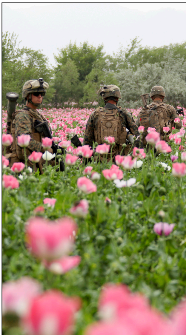
Marines returning to base after a security patrol in Helmand Province, Afghanistan.

Through judicious choices, forward planning and wise investments—ever mindful of the economy in which we live—we have worked diligently to determine the right size our Corps needs to be and to identify the resources we will require to respond to crises around the world, regardless of climate or place. As we continue to work with Congress, the Navy and the DoD in maintaining the institutional pillars of our high state of readiness, you have my assurance that your Corps will be "ever faithful" in meeting our Nation's need for military crisis response.