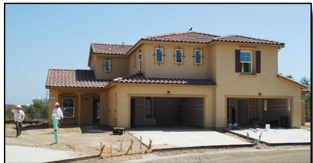
A duplex awaits final touches at one of Camp Pendleton's newest neighborhoods.

located at Camp Lejeune, North Carolina; Camp Pendleton and Twentynine Palms, California; and Marine Corps Base, Hawaii. These BEQ projects were typically completed in two years, with most at or below cost. These facilities, that incorporated energy efficiency measures, have significantly improved the quality of life of our single Marines, who for many years, lived in substandard, World War II era barracks. Our FY13 MILCON program includes a $49 million request for barracks, a motor pool and other facilities to support the consolidation of Marine Corps Security Force Regiment assets at Naval Weapons Station, Yorktown, Virginia. This project was not a part of our original BEQ initiative, but is necessary as the current facilities used by the Regiment at Naval Station Norfolk have been condemned.