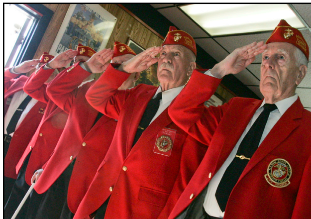
Keeping faith with our Veteran Marines.

importance of varying perspectives, compassion, courage, perseverance and self sacrifice through the Montford Point Marine history. We are thankful to Congress for recently conferring the Congressional Gold Medal on the Montford Point Marines, a fitting tribute to a pioneering group of Marines who fought valiantly in some of the bloodiest battles of the Pacific and later went on to serve in Korea and Vietnam.