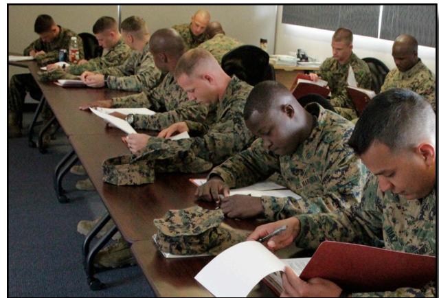
Marines study for a leadership exam at the Marine Corps Staff Academy, Camp Lejeune, NC.

Specifically, future training will center on the MAGTF Training Program. Through a standardized training approach, the MAGTF Training Program will develop the essential unit capabilities necessary to conduct integrated MAGTF operations. Building on lessons learned over the past 10 years, this approach includes focused battle staff training and a service assessment exercise modeled on the current exercise, Enhanced Mojave Viper. Additionally, we will continue conducting large scale exercises that integrate training and assessment of the MAGTF as a whole. The MAGTF Training Program facilitates the Marine Corps' ability to provide multi-capable MAGTFs prepared for operations in complex, joint and multi-national environments against hybrid threats.