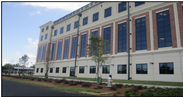
Joseph J. McCarthy Building, Marine Forces Reserve Headquarters.

FY13 Military Construction: The Marine Corps maintains a commitment to facilities and infrastructure supporting both operations and quality of life. Our military construction and family programs are important to sustain our force structure and maintaining readiness. This fiscal year we are proposing a $761 million Military Construction (MILCON) program to support warfighting, family housing and infrastructure improvements. The focus of our efforts this fiscal year is the construction of Joint Strike Fighter and MV-22B support facilities, infrastructure improvements, and training and education facility improvements. Additionally, this budget request includes replacement of inadequate and obsolete facilities at various locations.