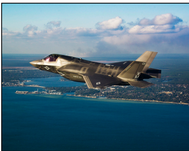
F-35B Lightning II Joint Strike Fighter en-route to Eglin Air Force Base.

The F-35B program has been a success story over the past year. Due to the performance of F-35B prototypes in 2011, the program was recently removed 12 months early from a fixed period of scrutiny. The F-35B completed all planned test points, made a total of 260 vertical landings (versus 10 total in 2010) and successfully completed initial ship trials on USS Wasp. Delivery is still on track; the first three F-35Bs arrived at Eglin Air Force Base in January of this year. Continued funding and support from Congress for this program is of utmost importance for the Marine Corps as we continue with a plan to “sundown” three different legacy platforms.