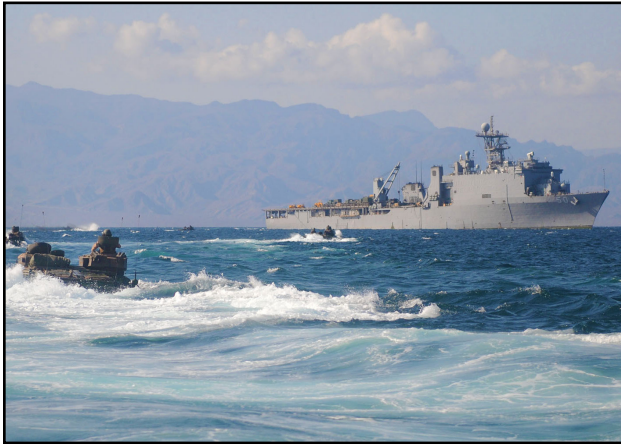
USS Carter Hall in the Gulf of Aden.

Joint Force. More than 60 years ago and arising out of the lessons learned from the Korean War, the 82nd Congress envisioned the need for a force that “is highly mobile, always at a high state of combat readiness...in a position to hold a full-scale aggression at bay while the American Nation mobilizes its vast defense machinery.” 6 This statement continues to describe your Navy and Marine Corps Team today. It is these qualities that allow your Marine Corps to protect our Nation’s interests, reassure our allies and demonstrate America’s resolve.