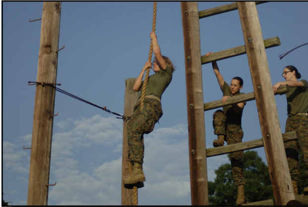
Marines training at Marine Corps Recruit Depot, Parris Island, SC.