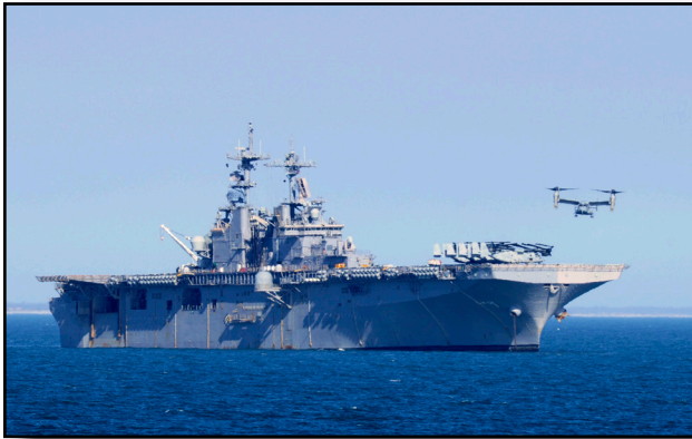
MV-22B Osprey prepares to land on the flight deck of the amphibious assault ship USS Wasp.

On a day-to-day basis, Marines will be forward-deployed and engaged, working closely with our joint and allied partners. When crises or contingencies arise, these same Marines will respond—locally, regionally or globally if necessary—to accomplish whatever mission the Nation requires.