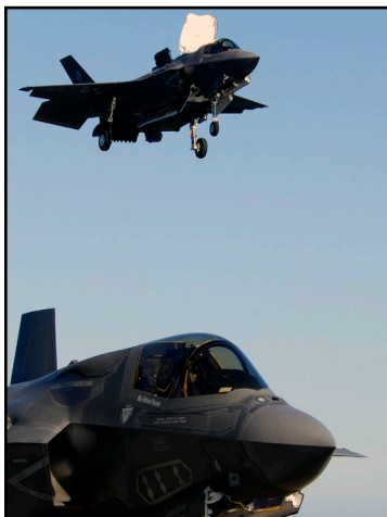
F-35B approaches the flight deck of USS Wasp.

As we reduce end strength, we must manage the rate carefully so we reduce the force responsibly. We will draw-down our end strength by approximately 5,000 Marines per year. The continued resourcing of this gradual ramp-down is vital to keeping faith with those who have already served in combat and for those with families who have experienced resulting extended separations. The pace of active component draw-down will account for completion of our mission in Afghanistan, ensuring proper resiliency in the force relative to dwell times. As our Nation continues to draw-down its Armed Forces, we must guard against the tendency to focus on pre-9/11 end strength levels that neither account for the lessons learned of 10 years at war nor address the irregular warfare needs of the modern battlefield. Our 182,100 Marine Corps represents fewer infantry battalions, artillery battalions, fixed-wing aviation squadrons, and general support combat