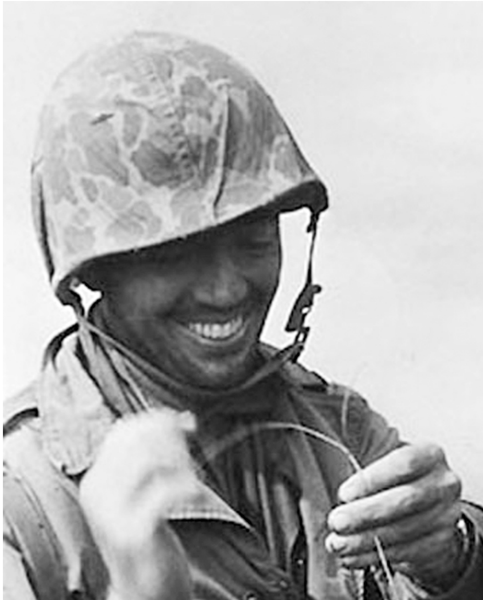
1stLt Harold G. Schrier