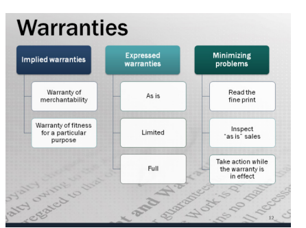
INSTRUCTOR NOTES: Use the information in the column to the right to guide your discussion.