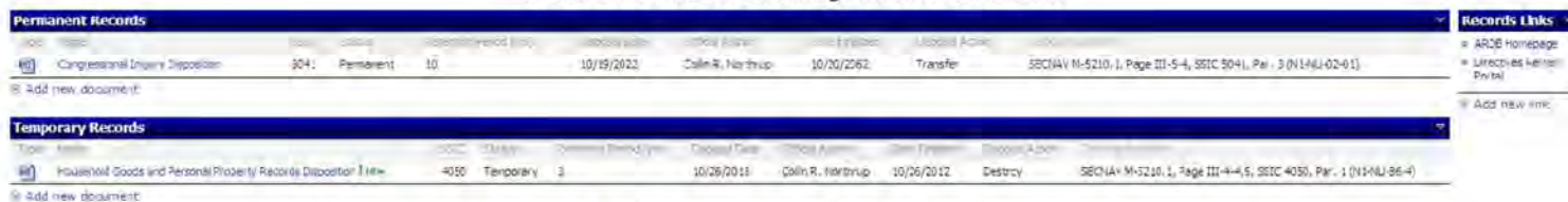
Figure 3-1.--Sample Electronic Records Management Dashboard.