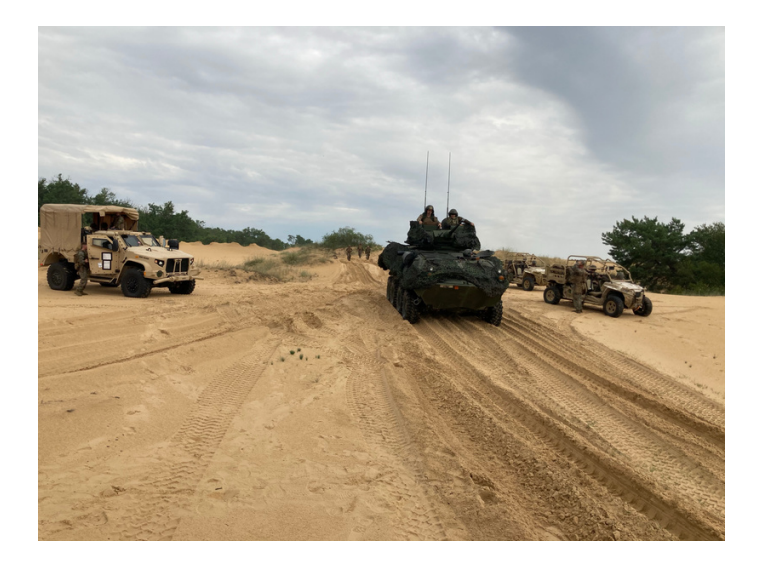
Capt Spanu in a LAV, attached to 1/6 in Oleshky Sands Training Area Ukraine.

Exercise Sea Breeze in its 21st iteration, was a U.S. and Ukraine co-hosted multinational maritime exercise held in the Black Sea designed to enhance interoperability of participating nations and strengthen maritime security within the region.