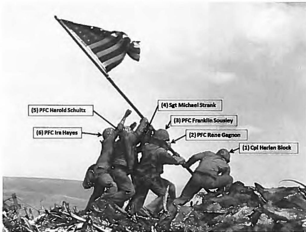
Figure 7: The Huly Board Determination of the Identities of the Six Flag Raisers in Mr. Rosenthal's Photograph

19. The opinion of the Board is that the identification of the second flag raisers is as depicted in Figure 7. [FF 1-82]