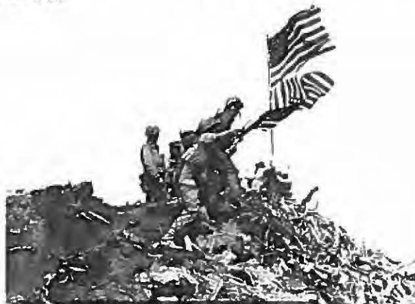
Figure 3: Cropped Photograph of the First Flag being Lowered and the Second Flag Being Raised