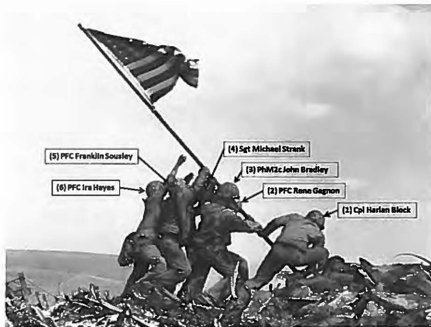
Figure 1: The del Valle Board Determination of the Identities of the Six Flag Raisers in Mr. Rosenthal's Photograph

The Huly Board used the position numbers indicated in Figure 2 below to reference individual locations.