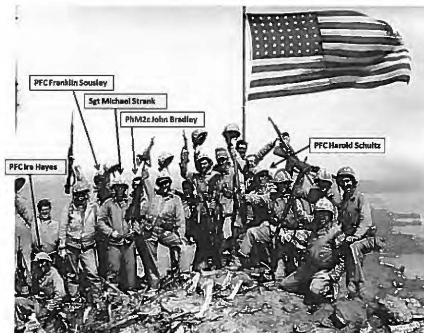
Figure 4: Annotated “Gung Ho” Photograph taken by Mr. Rosenthal

26. Shortly after the second flag was raised, Mr. Rosenthal took a group photo around the second flag, which became known as the “Gung Ho” photograph (see Figure 4). [Ref (f)]