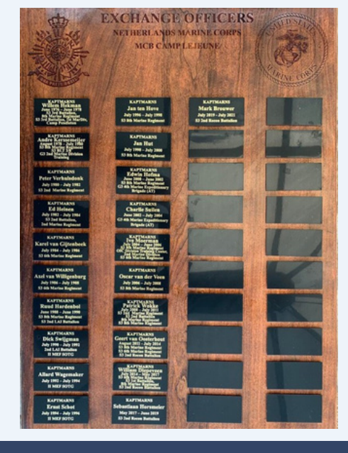
Plaque representing 45 years of history of the US Marine Corps and Netherlands Marine Corps Exchange Program